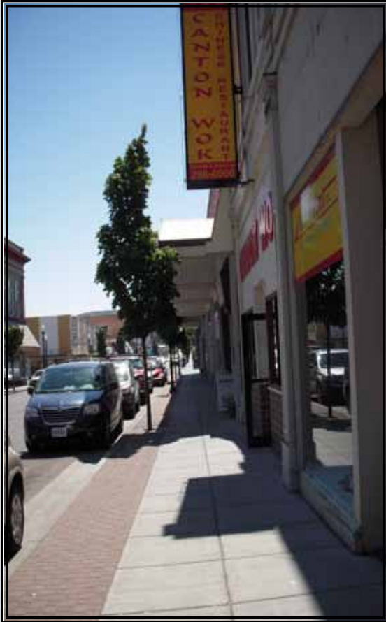
2nd Street Streetscape Improvements