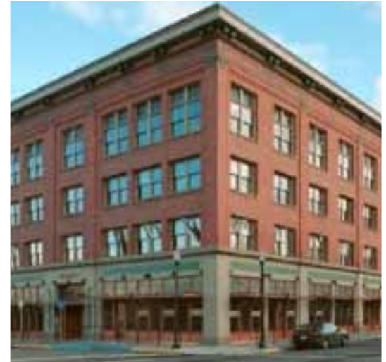
Commodore Hotel Renovation

The City of The Dalles adopted an urban renewal program to invest in improvements to the Downtown/ Columbia Gateway area in 1990. Urban renewal projects include creating a connection between the downtown and the riverfront, improving sidewalks and streets on 2nd Street in the downtown, resolving the problems at the Brewery Grade intersection with Highway 30 and promoting quality development in the 2nd Street corridor west of downtown.